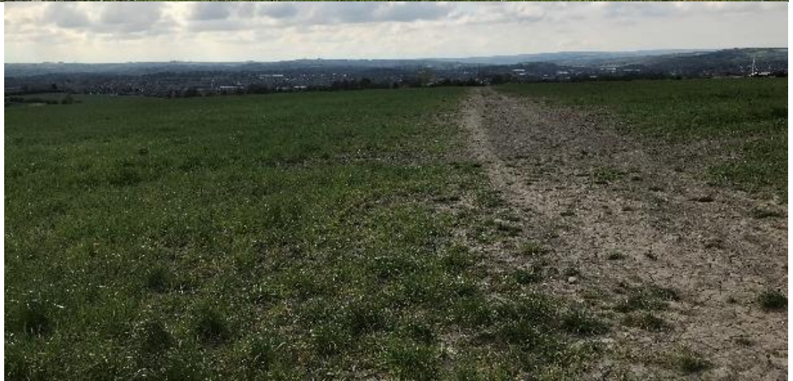
View from the site looking north west and north: